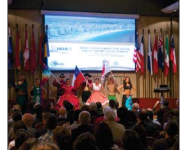
Local dancers entertain the crowd at the start of the IAIA14 closing plenary.